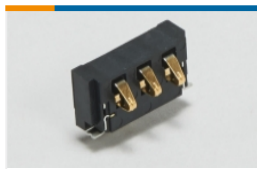
DC Jack Connectors(1)