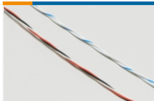
Twisted Pair Cable(6)